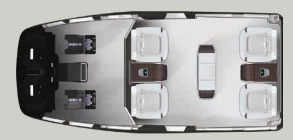
4 - PASSENGER + Foreword & Aft Cabinets + Optional Cabinet + Separation Wall