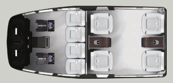
8 - PASSENGER + Foreword & Aft Cabinets + Separation Wall