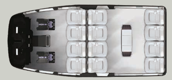
12 - PASSENGER + Curtain + Optional Cabinet