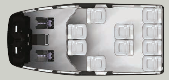
10 - PASSENGER + Curtain