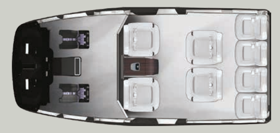
8 - PASSENGER + Foreword Cabinet + Separation Wall