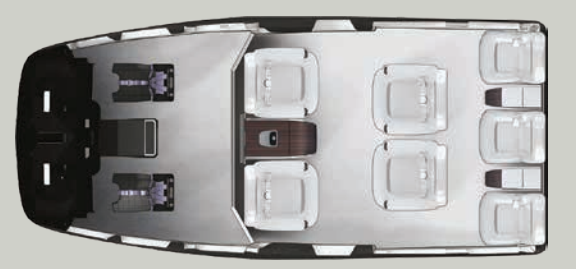
7 - PASSENGER + Foreword Cabinets + 2 Aft Cabinets + Separation Wall