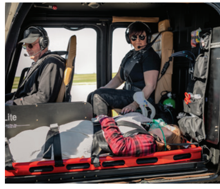
Med-Pac Inc EMS-LITE Interior

A critical mission served by a new aircraft. The Bell 505 offers an advanced platform for all airborne medical operators at an unbeatable cost. With a range of 306nm, the Bell 505 is the only HEMS-capable short light single aircraft in the market with the speed and range to aid global communities and save lives. Medevac pilots can harness the power of the Garmin G1000H NXi™ integrated avionics system and dual channel FADEC controlled engine to enhance their situational awareness and reduce additional pilot tasks. A range of cabin configurations from a quick change casualty evacuation system to a complete HEMS interior, provide the flexibility to meet your mission. With the ability to cover over 90% of the same area of a larger HEMS aircraft within the golden hour for nearly 50% of the cost, the Bell 505 is the modern, accessible choice for Helicopter EMS operations.