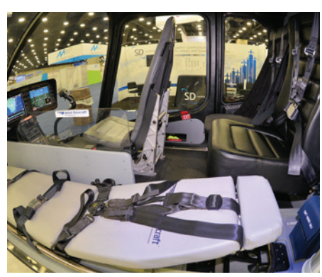
United Rotor Craft EMS Interior