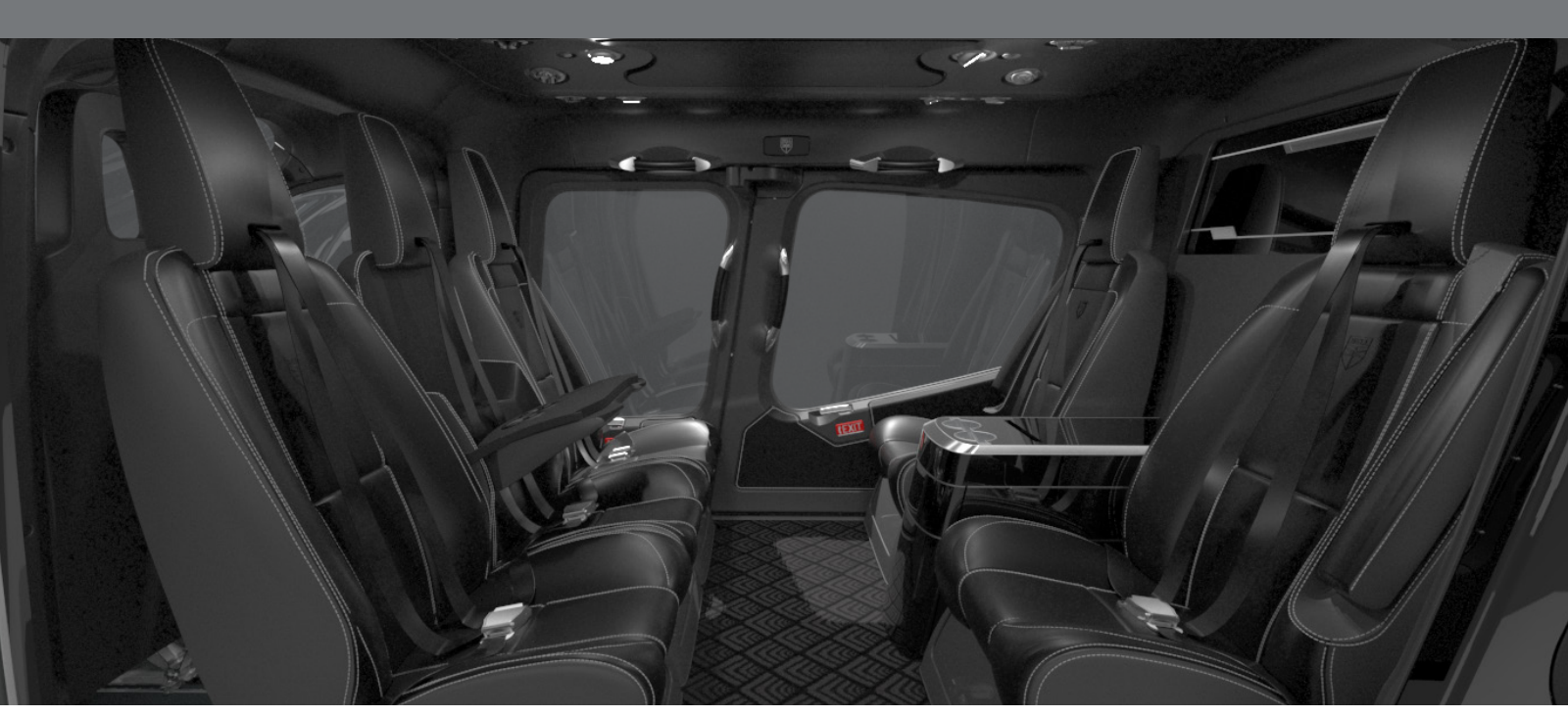
Shown in Charcoal + Jet Black